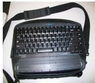
High Tech Example (Pac Mate)